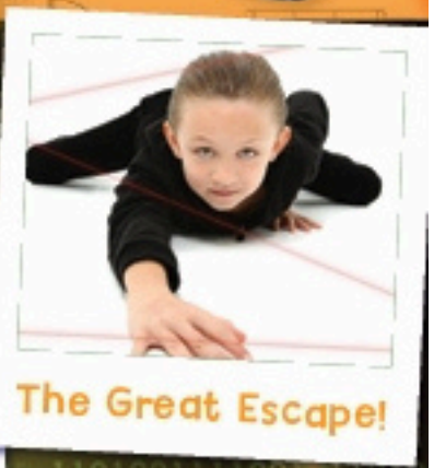
The Great Escape!