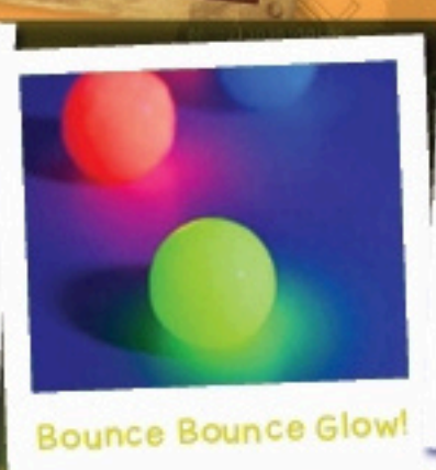
Bounce Bounce Glow!