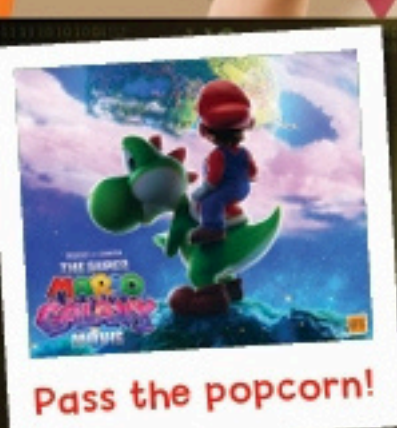
Pass the popcorn!