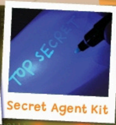
Secret Agent Kit